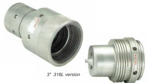
3" 316L version

For further details, please contact us. 如需了解进一步的详情，请联系我们。