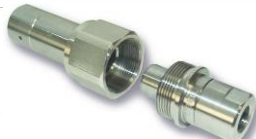
316L &amp; Autoclave version